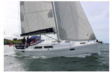
Menai IV—Hanse 385