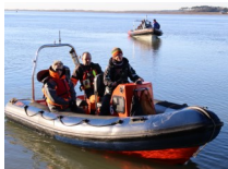
5.3m Tornado RIB