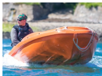
4.5m Tornado Rib